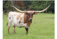
Diamond Q Bravo