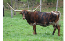
DUNN GUN BOMBER